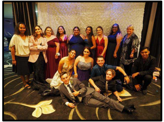
Group photo of graduation Indigenous and Torres Strait Islander students and staff 2019