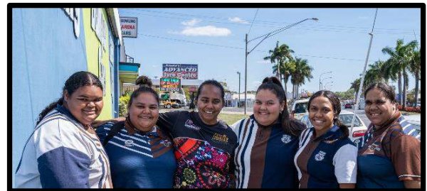
Di Welcome and Senior Students sitting down having a laugh