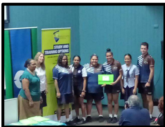
Senior QATSIF Graduating Ceremony

We have had the QATSIF graduation ceremony the first week back of term 4. This is where students who have received a QATSIF scholarship during the year, have certificates presented to them at an official ceremony at the Central Queensland University. We are very proud of the students who have used this scholarship to finish their education and we wish them the best of luck for the future.